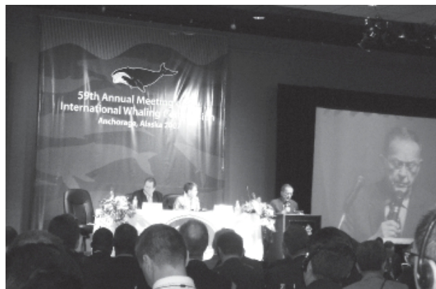
IWC Plenary Meeting at Anchorage

As renewal of an aboriginal subsistence whaling quota